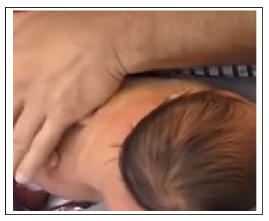
Figure 5: the actual adjusting thrust on the first correction