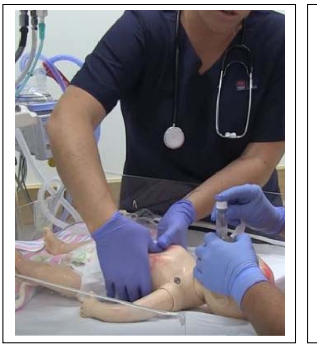
Figure 1: demonstration of neonatal resuscitation, where the initial contact on the sternum is shown followed by an indication of the depth of each chest compression

Step 3 involves chest compression, which may focus biomechanical stresses deep into the sternum and through the rib cage to the mid-thoracic spine. It is common in children and adults for chest compressions to fracture the sternum or fracture and/or dislocate ribs, and while chest compression used for the adult involves considerably greater force that what is expected for a neonate, guidelines recommend that the infant be placed supine on a hard surface and the chest is compressed three times followed by a "rescue breath", involving approximately 100 compressions and 30 breaths per minute. The compressions are to a depth of 4 cm, or approximately one third of the infant chest thickness (13) (14) (15).